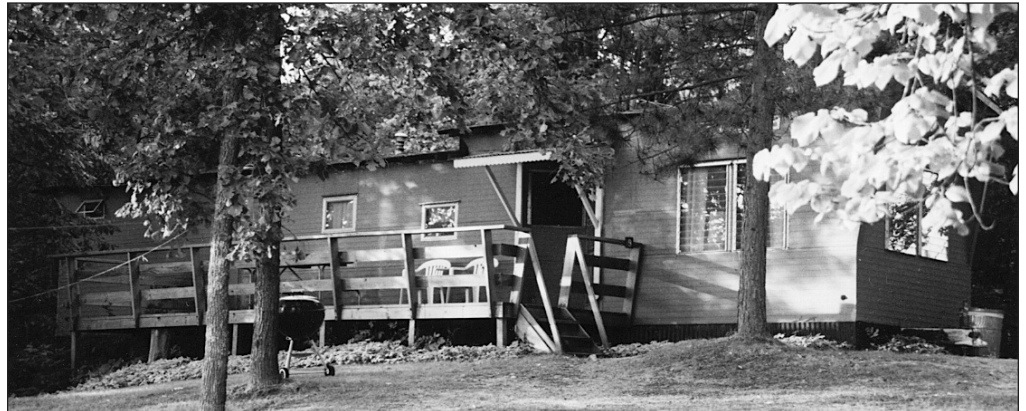
(Above) The old #9 on its last season. Now it has become the new storage shed for the resort.