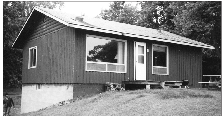
(Right) The new #9 pictured in its old location (#21) at Forestview.