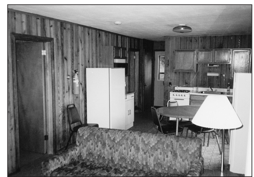
This shows the cabin interior as it was at Forestview. The walls are covered in beautiful sandblasted yellow pine from Tennessee.

"Booked solid", "Nope", "Out of business", etc., etc., etc.