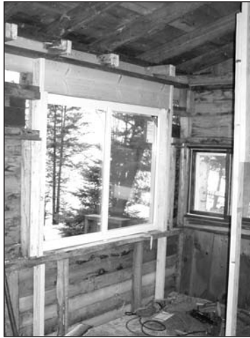
The new lakeside window is in and the old ceiling is gone, making the whole room brighter.

replaced, a new counter will be installed in the kitchen. The walls will have sheetrock instead of paneling. The bedroom will be about the same with new carpeting.