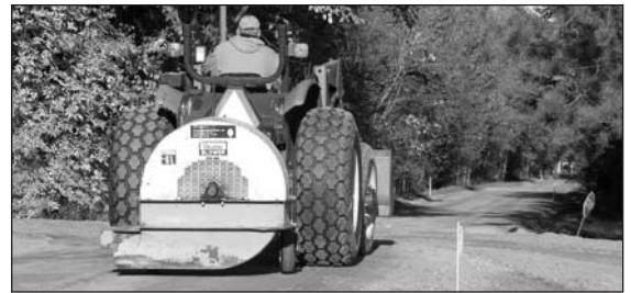
Along with scrapers, rollers, graders, waterers and other equipment, this special blower came through to clear the surface of any leaves before paving.