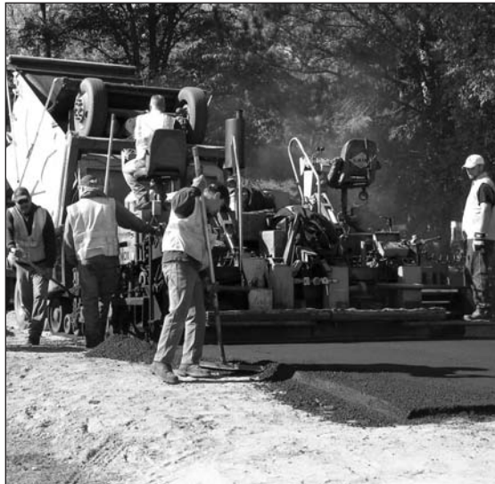
Several crew members worked at paving each driveway entrance along the stretch of trail between Hwy. 371 and Benedict. Each crossing had to be prepared on both sides before the main crew came through to pave the trail.

Bikers can now head out onto the paved trail right from their cabin. Those looking for a more challenging ride should try the Heartland Trail towards Akeley, and then take the trail heading south to Hackensack. There is a parking lot for bikers who want to load up the bikes and start the ride at the linking trail just before Akeley. The