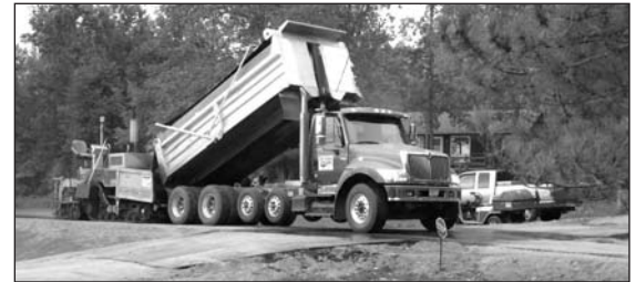
Dump truck after dump truck hooked up to reload the paving machine as it came through the resort.

Apparently, there is a great ice cream shop open during the summer months for a perfect reward. The other reward is to have a truck waiting in Hackensack to put the bikes in - oh, what a nice ride back to Walker that makes! (Thanks, Jack!)